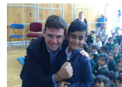
Presenting Andy Burnham Mayor of Greater Manchester with his Peace Mala Bracelet.