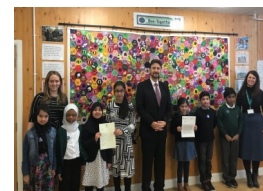
Our Student Council with MP Afzal Khan

Our children are taught about the skills needed for socio-economic success through Manchester Skills for Life and these are embedded in our celebratory events, such as assemblies and